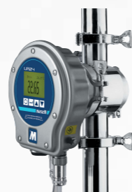
Syrup Room - Sugar Dissolution