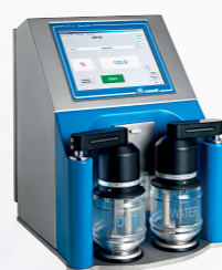
Laboratory - Diet Soft Drinks