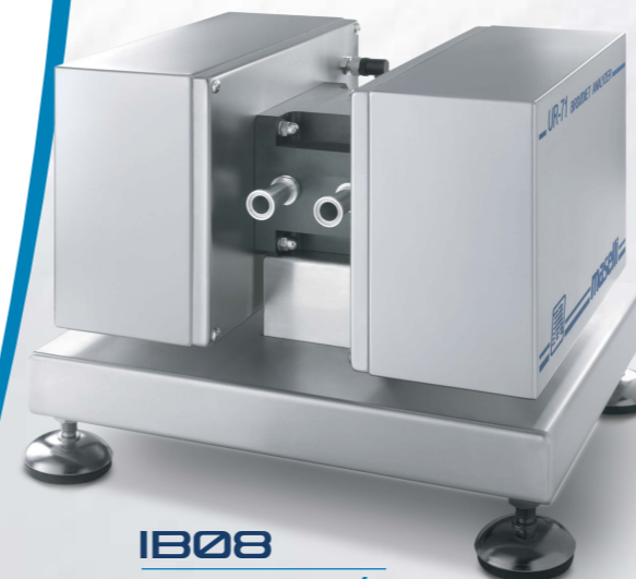
IB08 Brix-Diet CO 2 P/T