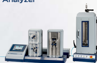
Laboratory - Diet, Brix, Fresh Brix, CO 2